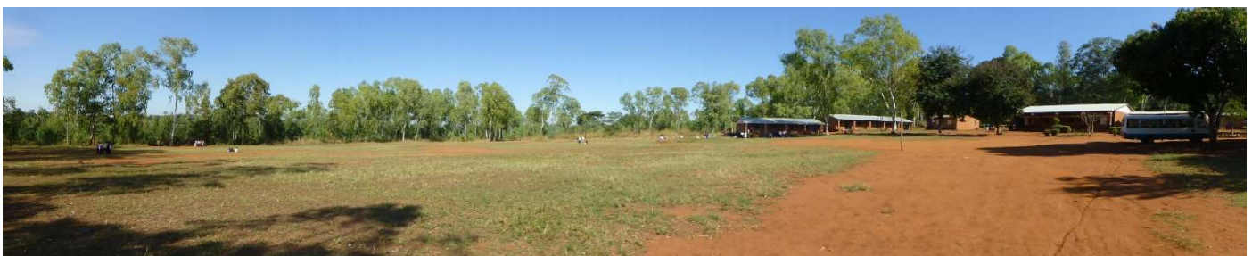
Mulanje Mission Community Day Secondary School