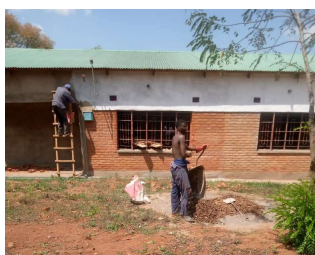
Teachers houses near completion